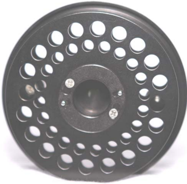
Post 1998 Gunnison Spool – this Spool has two Screws, two Plungers and a Change Ring for Left-Hand wind to Right Hand wind conversion.