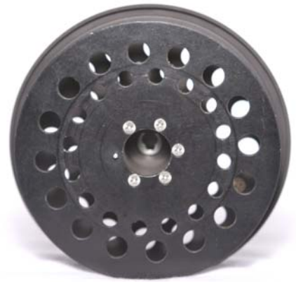
Three piece one Plunger Pre 1994 Gunnison 4 Spool