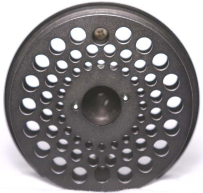
Gunnison Spools 1995 to 1998 – this Spool has two Plungers and a bright Anodize finish.