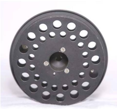
Three piece one Plunger Pre 1994 Gunnison Spool