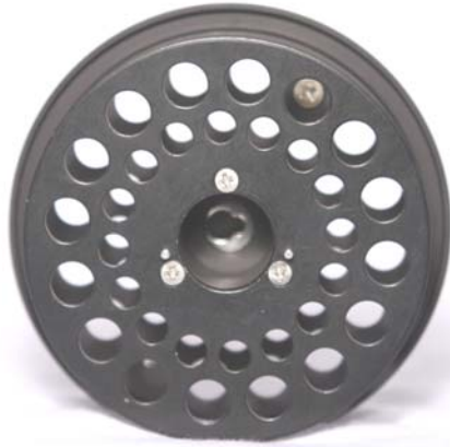
Three piece two Plunger Pre 1994 Gunnison Spool